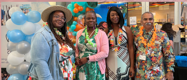
CFCE Adoption Unit

After a two-year hiatus necessitated by the COVID pandemic, families and child welfare professionals alike were excited to gather again to celebrate one of the most anticipated events of the year. As in years past, the Miami Children's Museum hosted Miami Dade County's 2022 National Adoption Day event. This year's theme was all about snowflakes because snowflakes are unique, just like each of our forever families! More than 30 adoptions were finalized at this year's National Adoption Day.