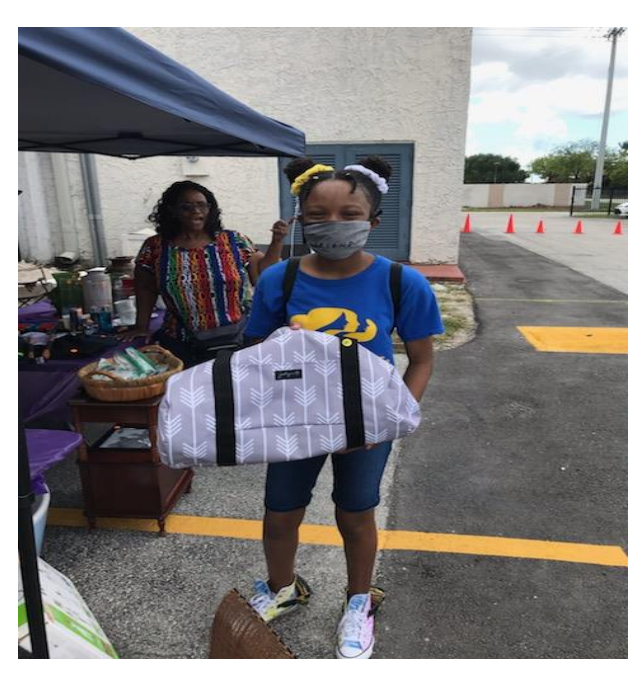
Great deals for a great cause!