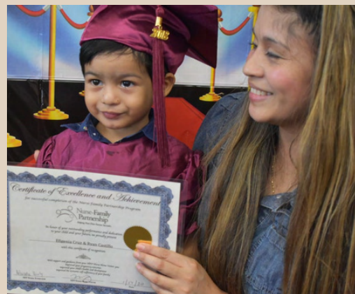
Nurse Family Partnership Program Graduate