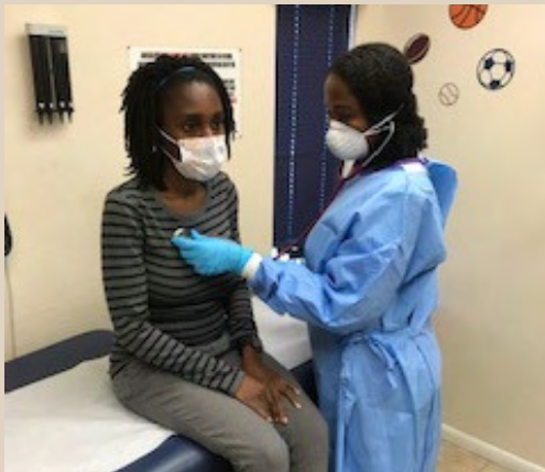
Clinic patient given an exam.

Pediatrics General Medicine Dental Obstetrics & Gynecology Nutrition Nurse Family Partnership DCF Access Point