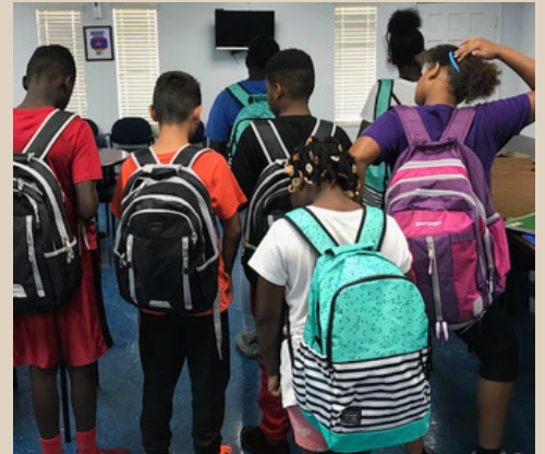
Children from CFCE receive backpacks

Foster Care Adoption Emergency Shelters Safety Management