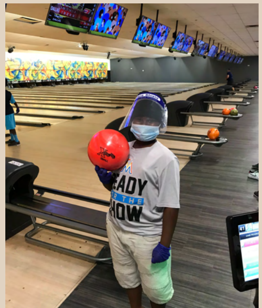
Freedom School camp is fun and educational!