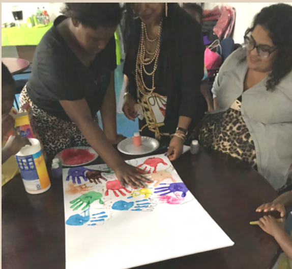
Clients prepare thank you card for corporate donors.

Many of the families received their services virtually during the COVID-19 pandemic. Program events included: a Back to School book bag drive-thru, Thanksgiving turkey box giveaway and a Christmas Toy drive.