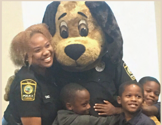
S.N.A.P. visits the Miami Gardens Police Department