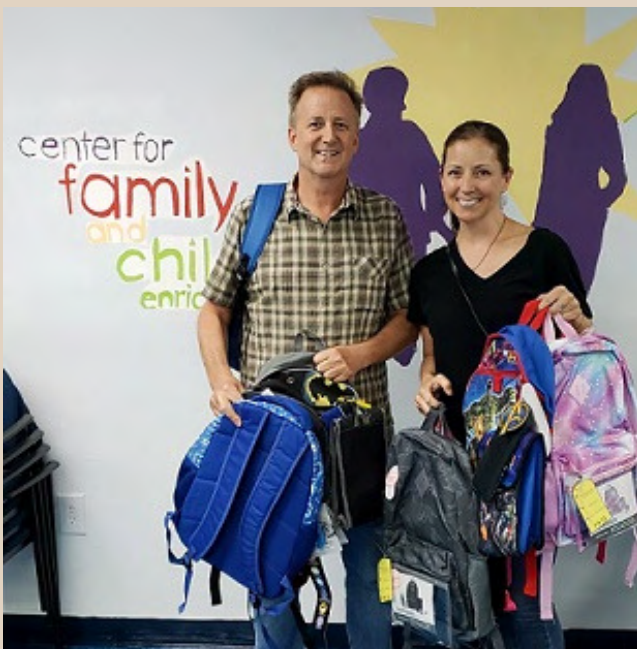
Friends of CFCE donate to the back to school drive.

Behavioral Health continues to work remotely during the Pandemic, delivering quality telehealth services for individuals and groups.