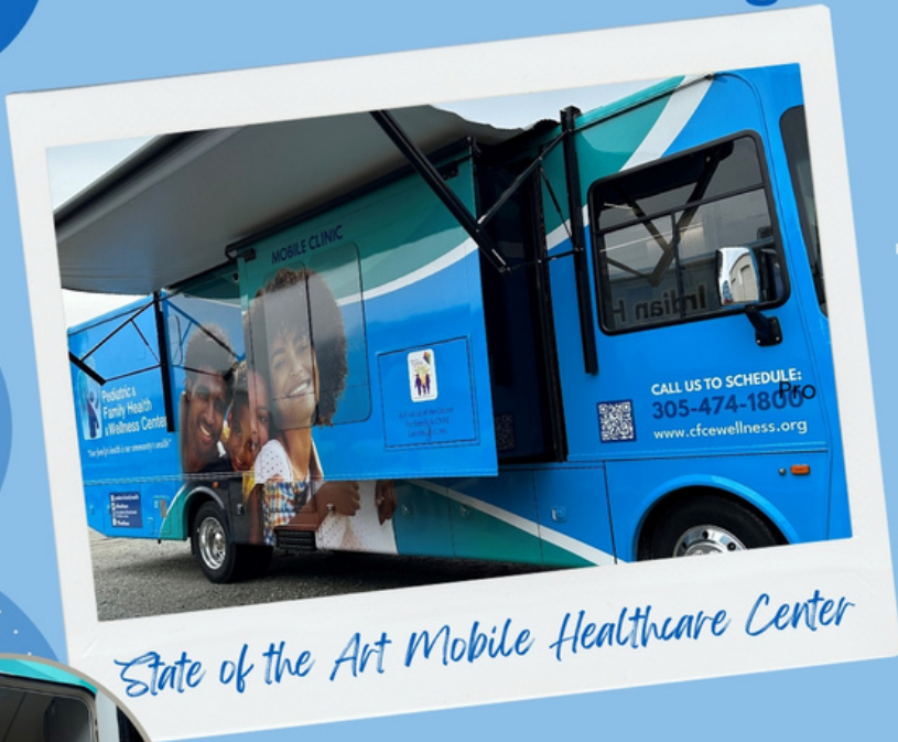
State of the Art Mobile Healthcare Center