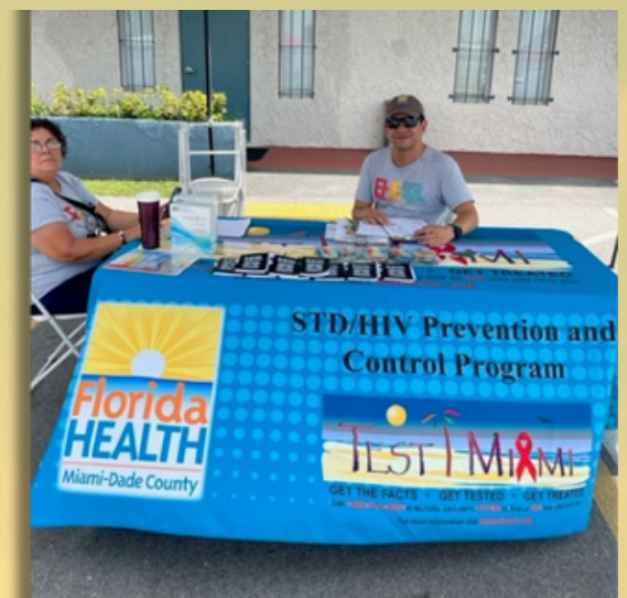
Florida Department of Health providing free HIV screenings through in Home HIV kits available for distribution