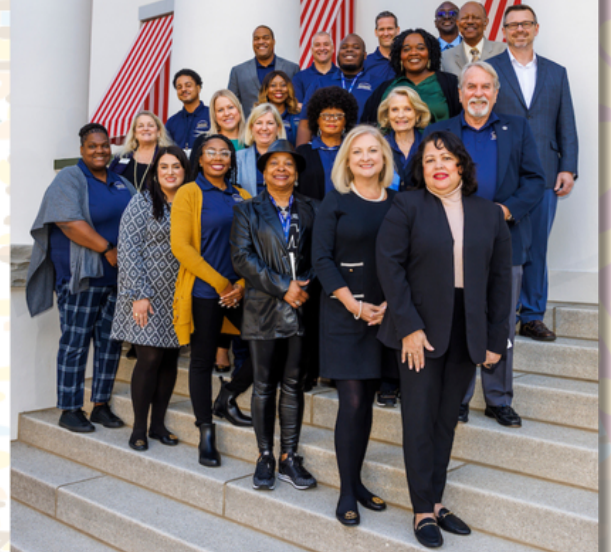
Florida Network of Youth and Family Services Hill Day 2023