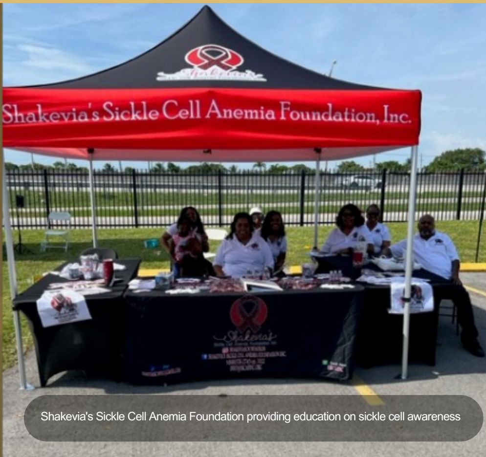
Shakevia's Sickle Cell Anemia Foundation providing education on sickle cell awareness

The Juneteenth Community Health Fair was a resounding success, blending the oldest nationally celebrated commemoration of the ending of slavery in the