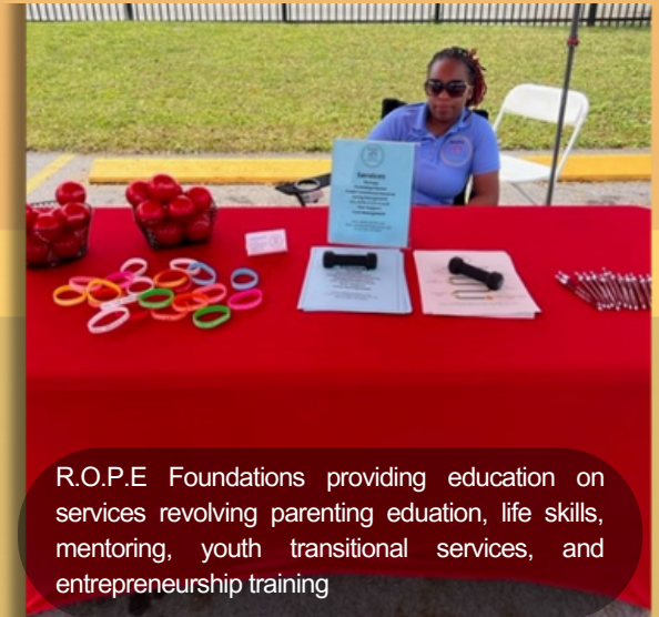
R.O.P.E Foundations providing education on services revolving parenting education, life skills, mentoring, youth transitional services, and entrepreneurship training

The fair showcased diverse vendors, including Shakevia Sickle Cell Foundation Inc, Feeding South Florida, Excess Wireless, Sonolife Care, Lavish Touches Hair & Spa, R.O.P.E Foundation, and The Florida Department Of Health. Their diversity provided numerous informational resources that enhance the community's well-being. Additionally, the Pediatric & Family Health & Wellness Center distributed freebies, which included health-related items such as hand sanitizers, reusable water bottles, and informational brochures.