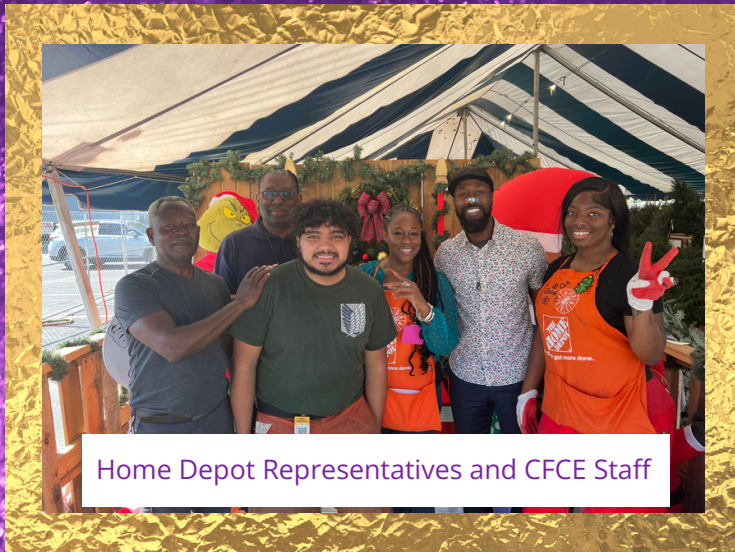
Home Depot Representatives and CFCE Staff